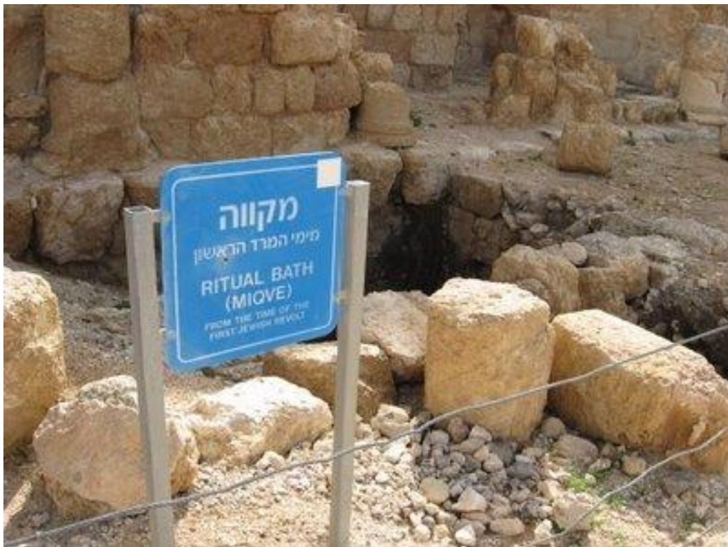
Mikveh: An Ancient Ritual Bath (Judaism)