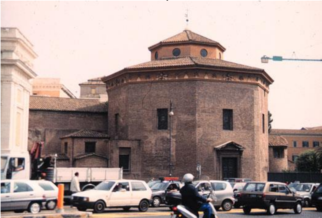
The Lateran Baptistery, Rome