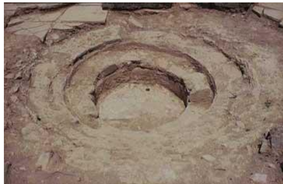
Baptistery at Nemea