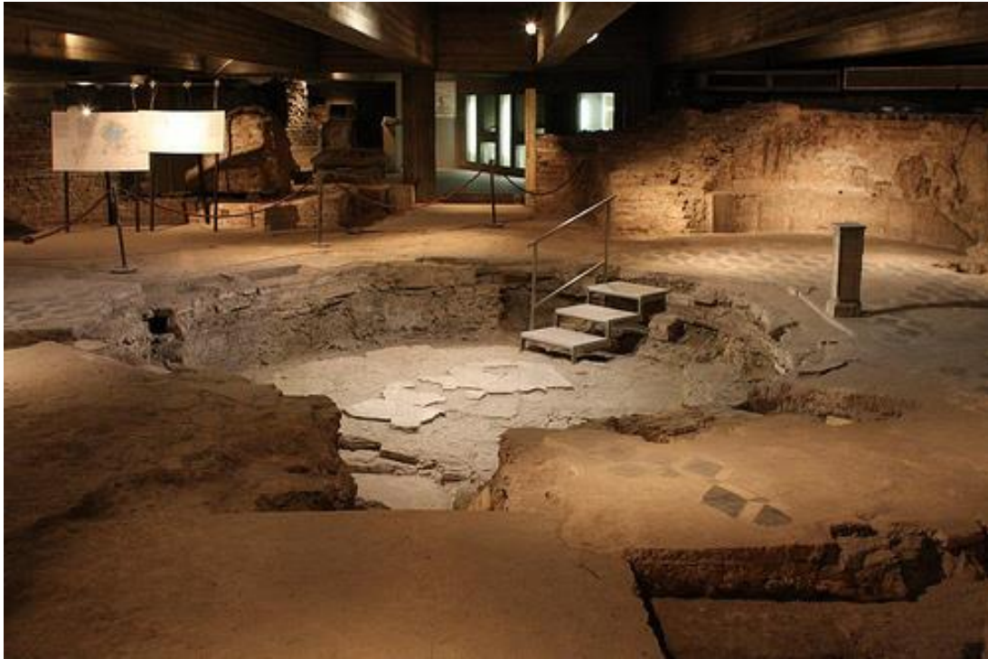
Milan, Early Baptistery Found while working on the subway. This is like the baptistery at St. John's Lateran, Rome