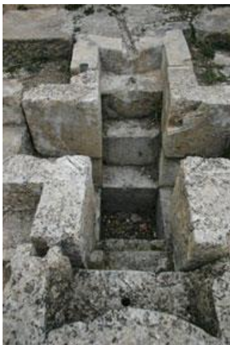
Alahan (Isauria) Turkey