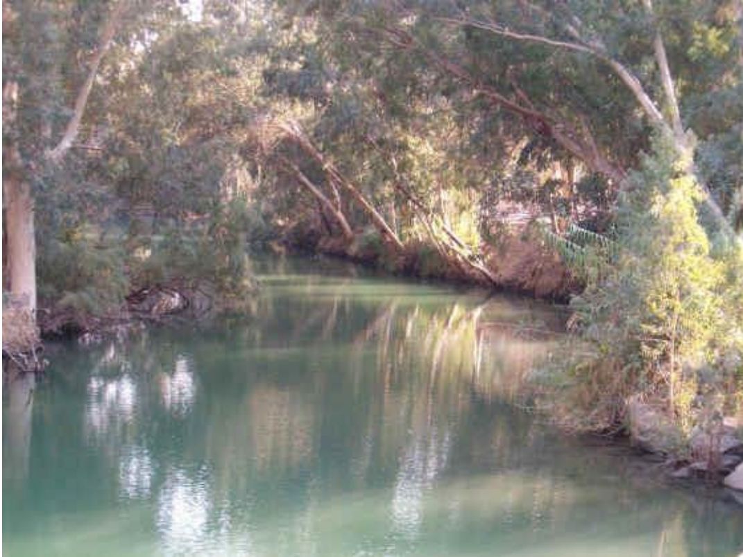
The Jordan River