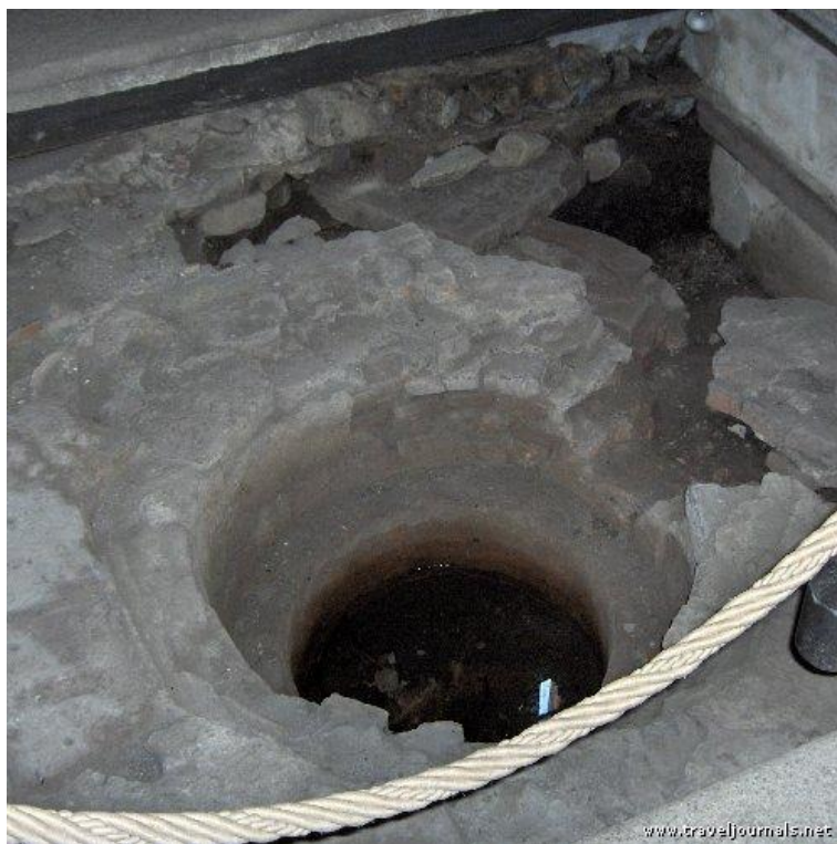
5 th Cen. Baptistery, Verbania, Italy