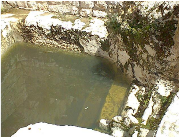
A Mikveh in the Temple Precinct