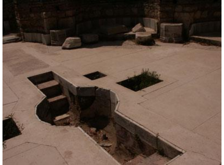
Basilica of St. John's, Ephesus