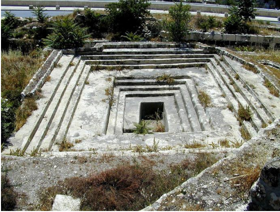
Jerusalem: A Mikveh south of the Temple