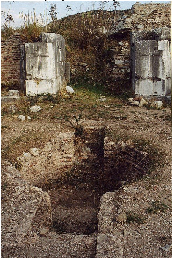
Church of the Virgin Mary, Ephesus